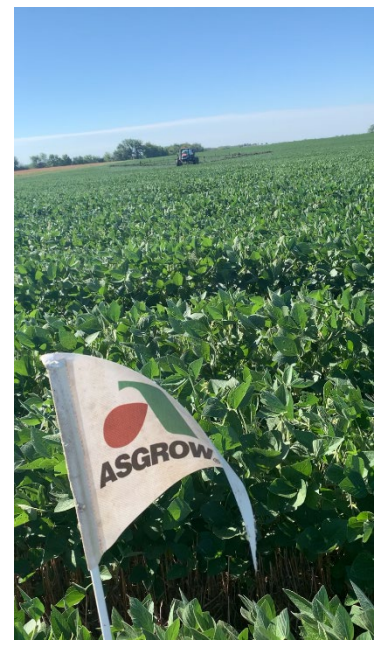
Foliar feed trial being applied on Asgrow soybeans, R4 stage