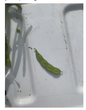
Soybean pod with four developing seeds