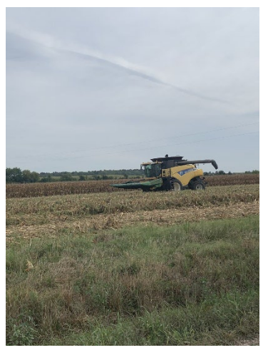
Combines found across Southeast Kansas and Southwest Missouri over the past few weeks